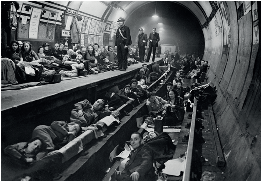
Aldwych tube station being used as a bomb shelter in 1940.

We will also hear about the situation of POWs at this time and how they were able to leave their camps and mix with the local population.